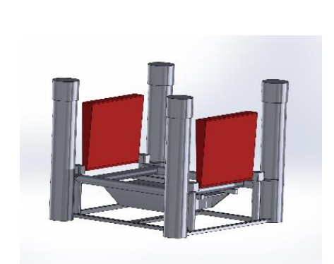
Figure 1 WEC Archetype I - FOSWEC2 (Oscillating surge wave energy converter type).