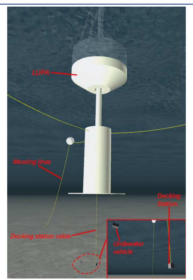
Figure 6 LUPA WEC-AUV coupled model.