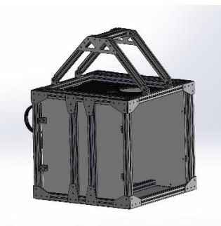
Figure 4 Docking station.